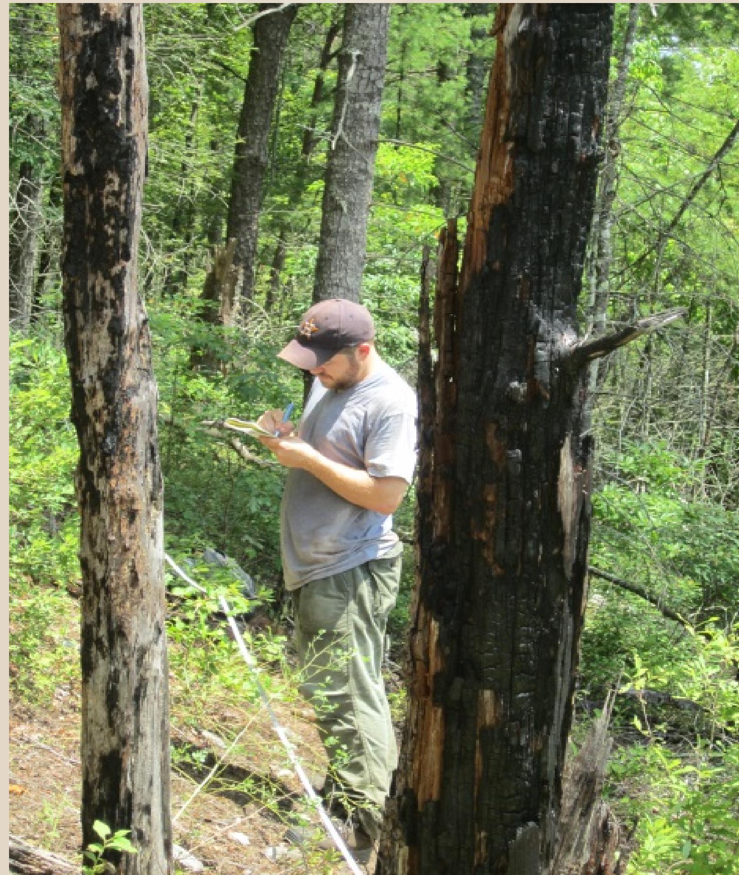
Undergraduate student recording field measurements in a recently burned pine forest.