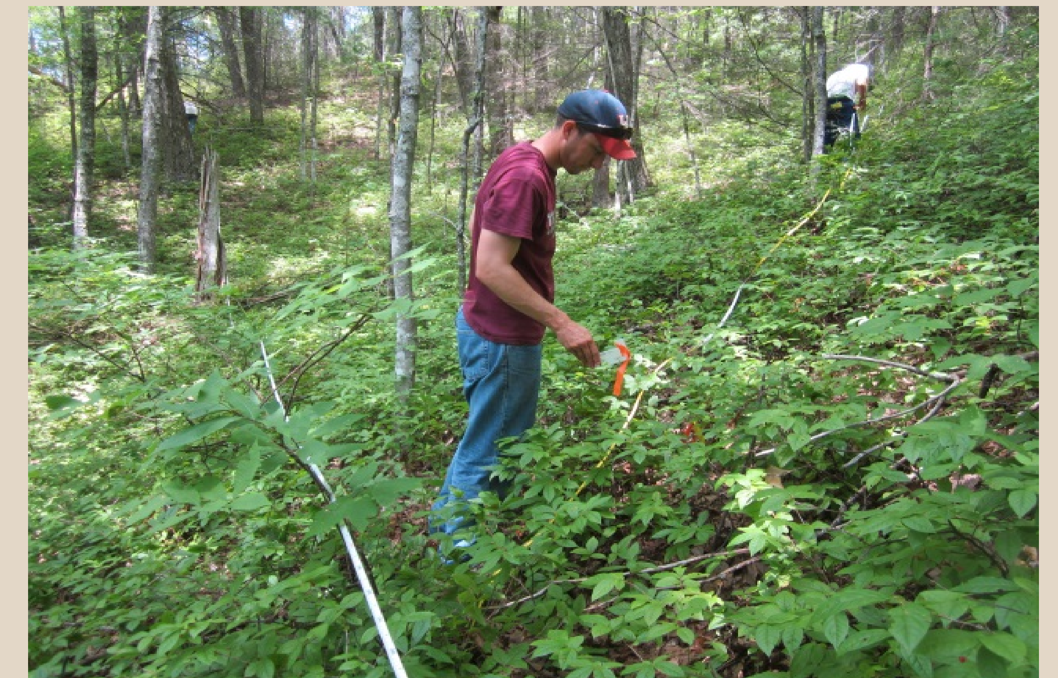
Undergraduate student measuring vegetation characteristics in a recently burned oak forest.

This project contributes to my larger research and teaching program related to the history of fire and its influences on vegetation. Following decades of fire suppression, many resource managers are reintroducing fire to restore decadent fire-dependent plant and animal communities. The students were able to contribute to work that provides tangible benefits for resource management.