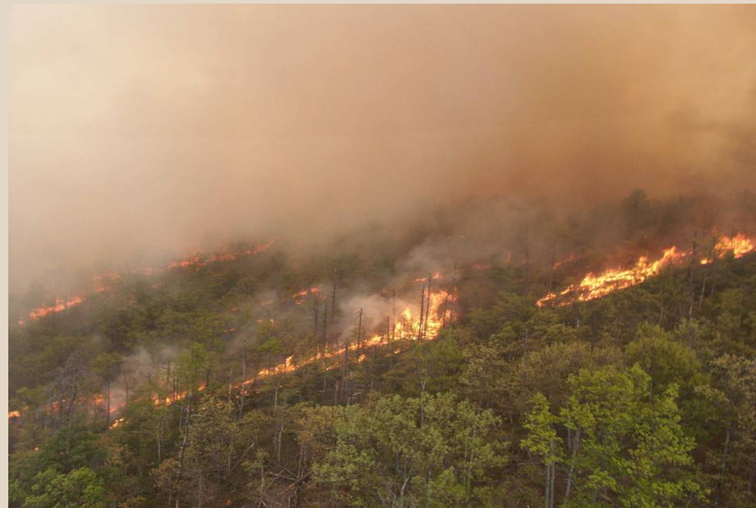
Photo of prescribed fire