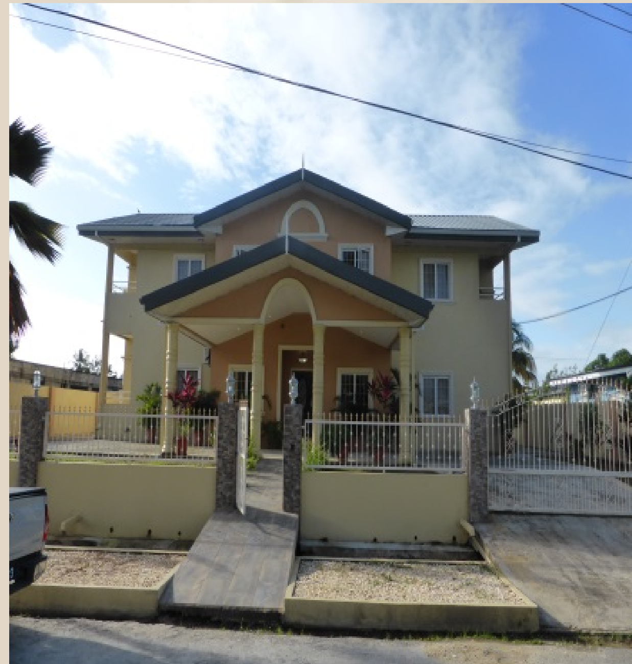
Norma's Bed & Breakfast is where we stayed and conducted many of our debriefing sessions each night