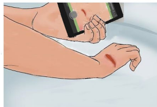
Self-Monitoring with App