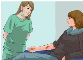
Traditional Clinical Monitoring